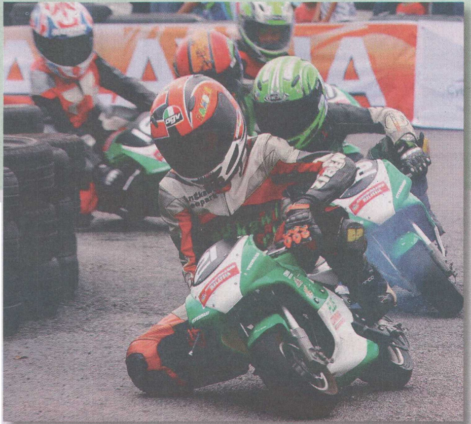
Above: Catch a mini bike race at the Cyberjaya Circuit.

Today: Join the adrenaline rush at the Cyberjaya Motorsports event featuring mini bike racing and endurance go-kart racing. Visitors will be treated to exciting tandem drifting showdowns. Families with kids can enjoy the karaoke competition and children's colouring contest. The endurance go-kart racing category is open to the public with reduced entry fees. From 8.30am till midnight. Free admission.