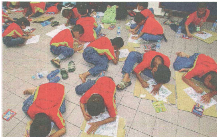
Appreciation for nature: The children from Kompleks Penyayang Bakti Sungai Buloh concentrating on their art during the colouring competition.

Language English Page No M4 Article Size 643 cm 2 Color Full Color ADValue 24,062 PRValue 72,187