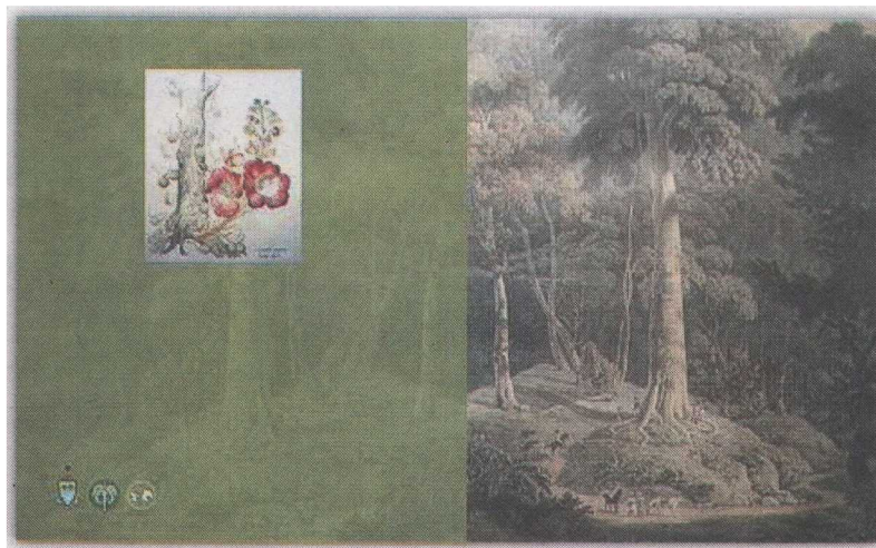
Heritage outlook: The cover of 'Heritage Trees of Penang'.

"We believe that this will be the first, extensive book about the trees in Penang," she said, adding the book would appeal to everyone, especially locals who could recognise the trees in it.