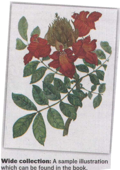
Wide collection: A sample illustration which can be found in the book.

Language English Page No M8 Article Size 592 cm 2 Color Full Color ADValue 12,000 PRValue 36,000