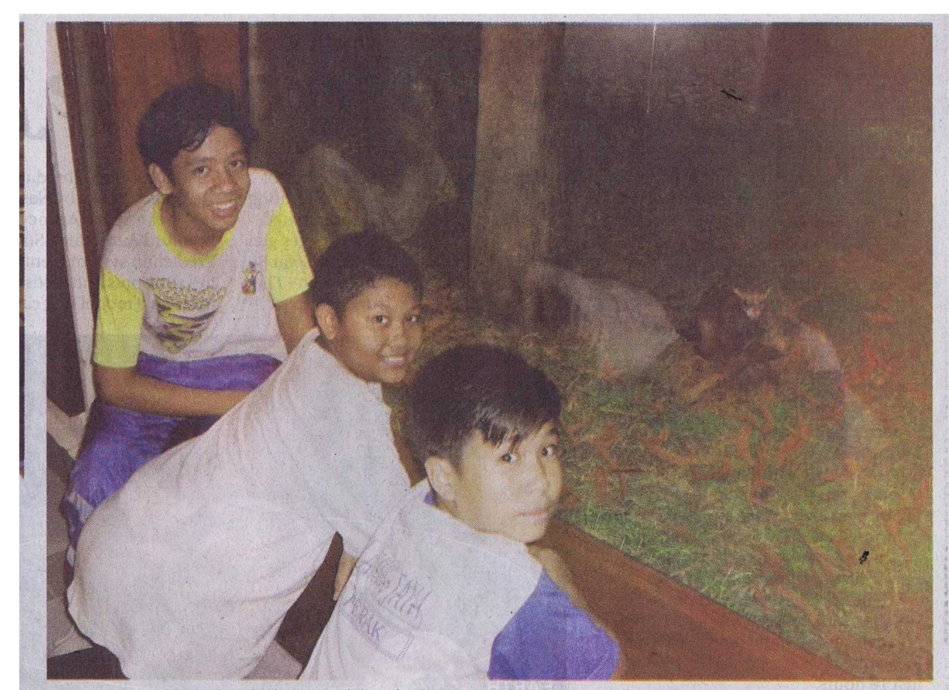
SCHOOLBOYS take a close look at an exhibit of a "musang pulut" (civet or toddy cat) in the FRIM Research Gallery and Museum.

Date 28 Oct 2010 Language English T1,3 New Sarawak Tribune Page No MediaTitle 1464 cm<sup>2</sup> Section Supplement Article Size Full Color Journalist N/A Color Frequency Daily ADValue 6,167 46,471 / 164,773 PRValue 18,500 Circ / Read