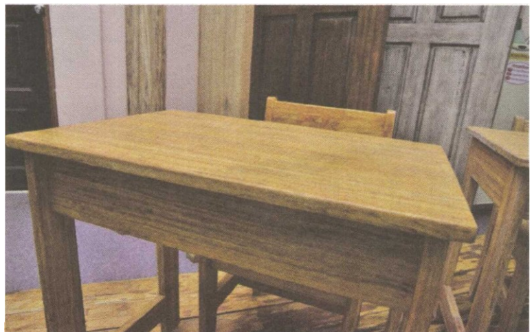
Artificial timber has the same qualities as the real thing