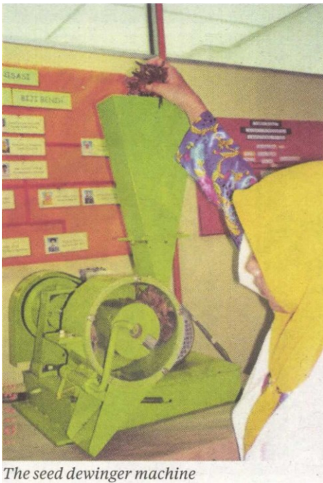
The seed dewinger machine