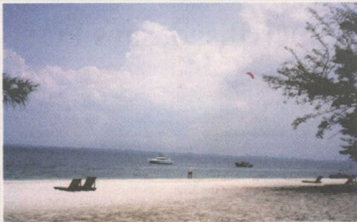
July 11, 2012: The pristine sandy beaches of Talang Satang Island is among the natural treasures of Lundu District, Sarawak.