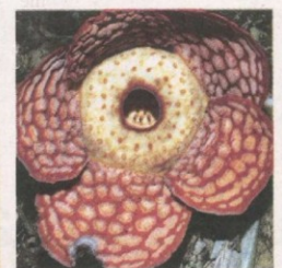
June 26, 2012: A five-petalled Rafflesia at the Royal Belum State Park, Cerik, Perak.