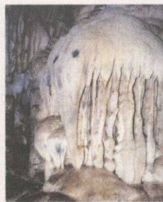
June 17, 1994: Kota Gelanggi Cave near Jerantut, Pahang has limestone formations that are at once delightful and scientifically fascinating.