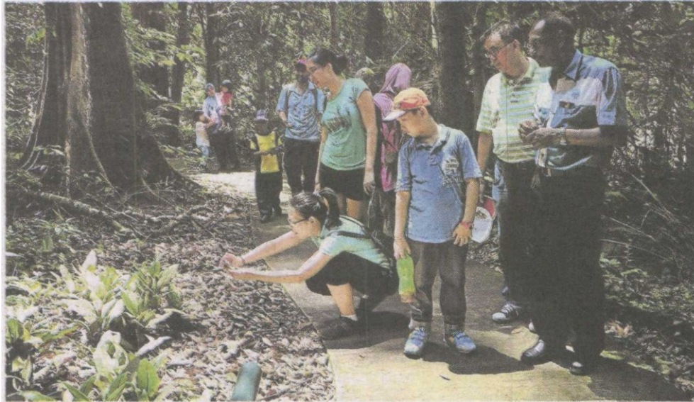
Nature walk: Participants taking pictures during the walk.