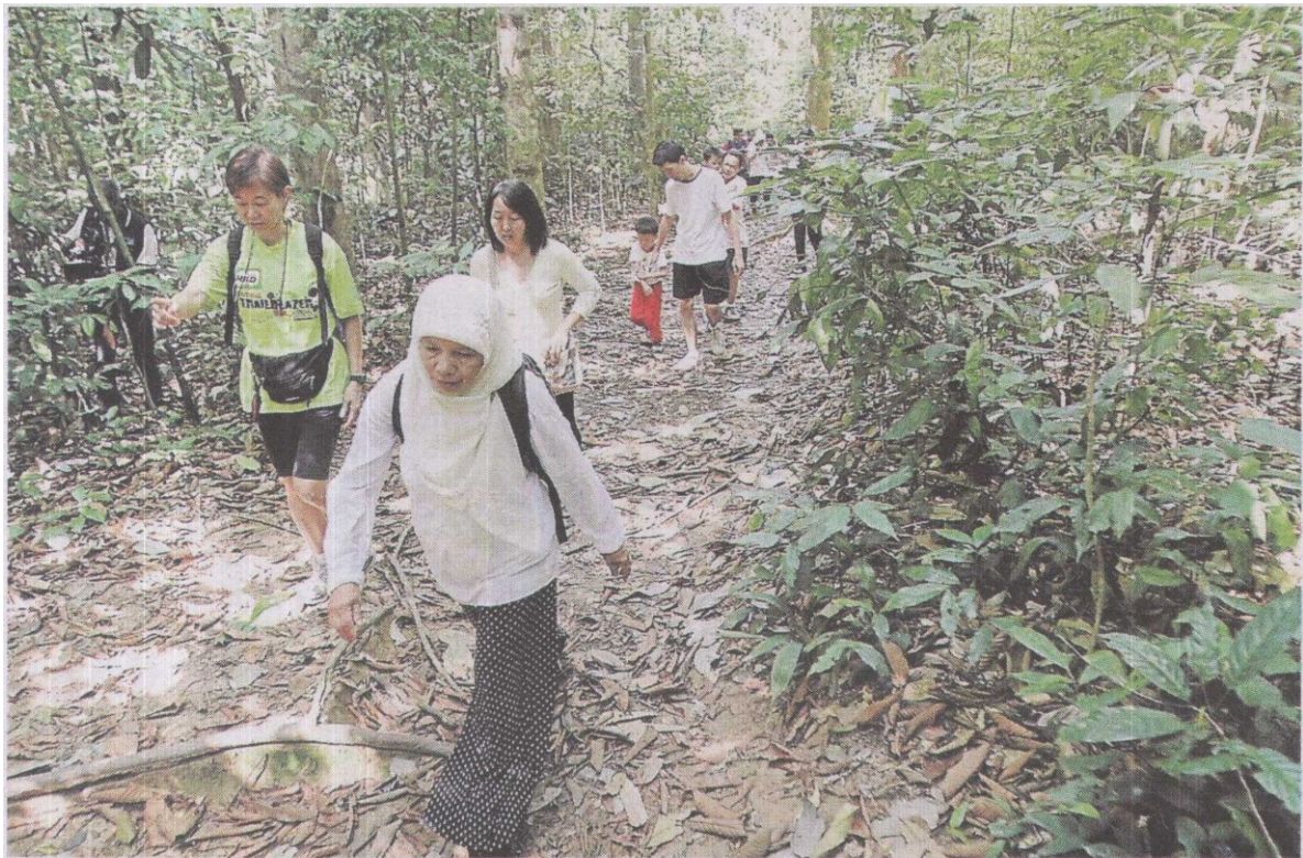
Trail blazers: Joggers eagerly following the trail at FRIM forest.