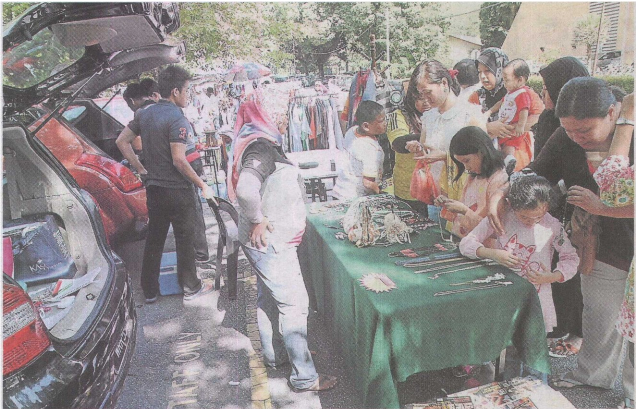
Brisk business: Joggers checking out the car boot sale at Kepong FRIM.