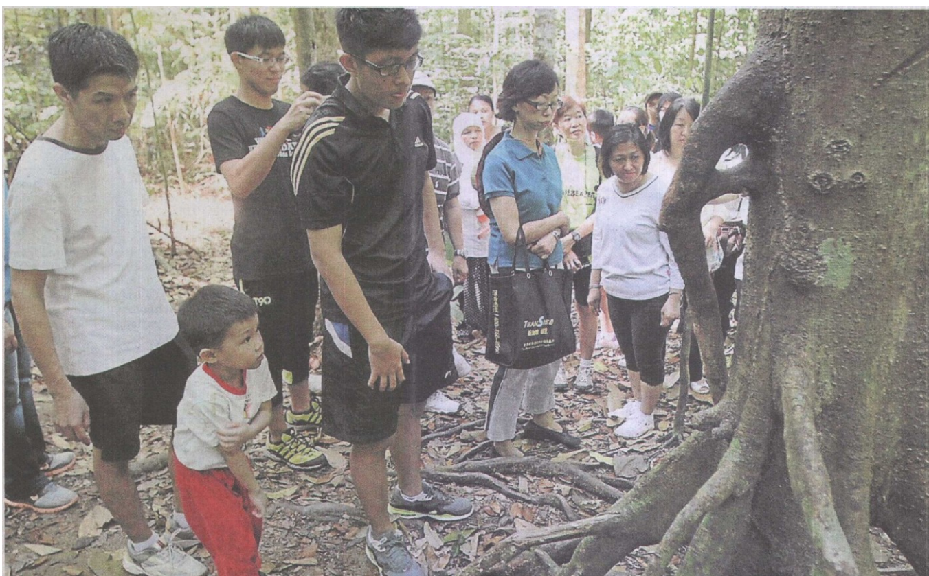
Mighty attraction: Joggers marvelling at the elephant tree.