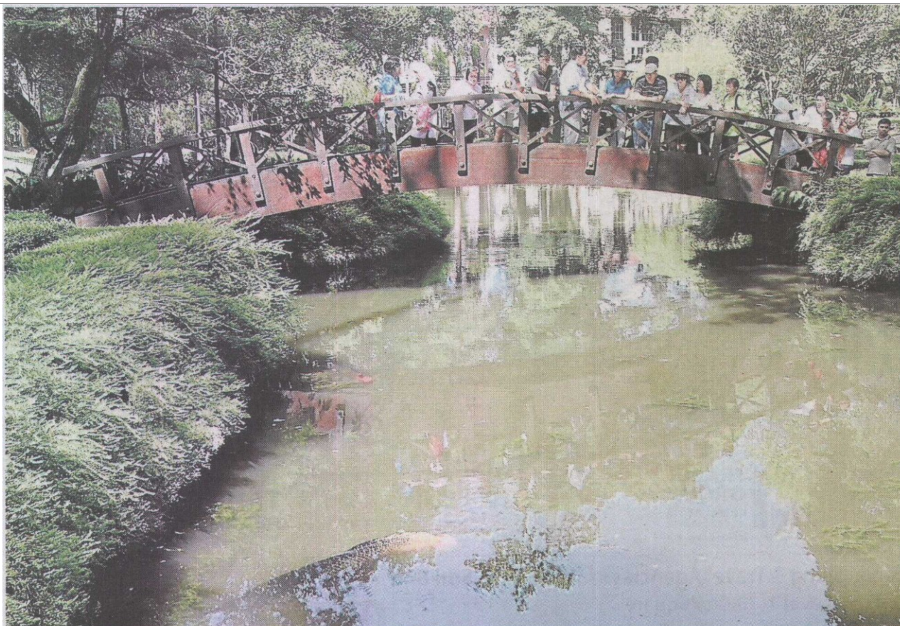
Watching the water: Joggers watching the giant dragon fish from a bridge.