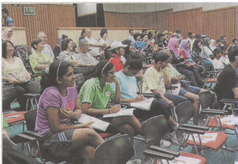
Informative: Joggers listening to a presentation at Kepong FRIM.