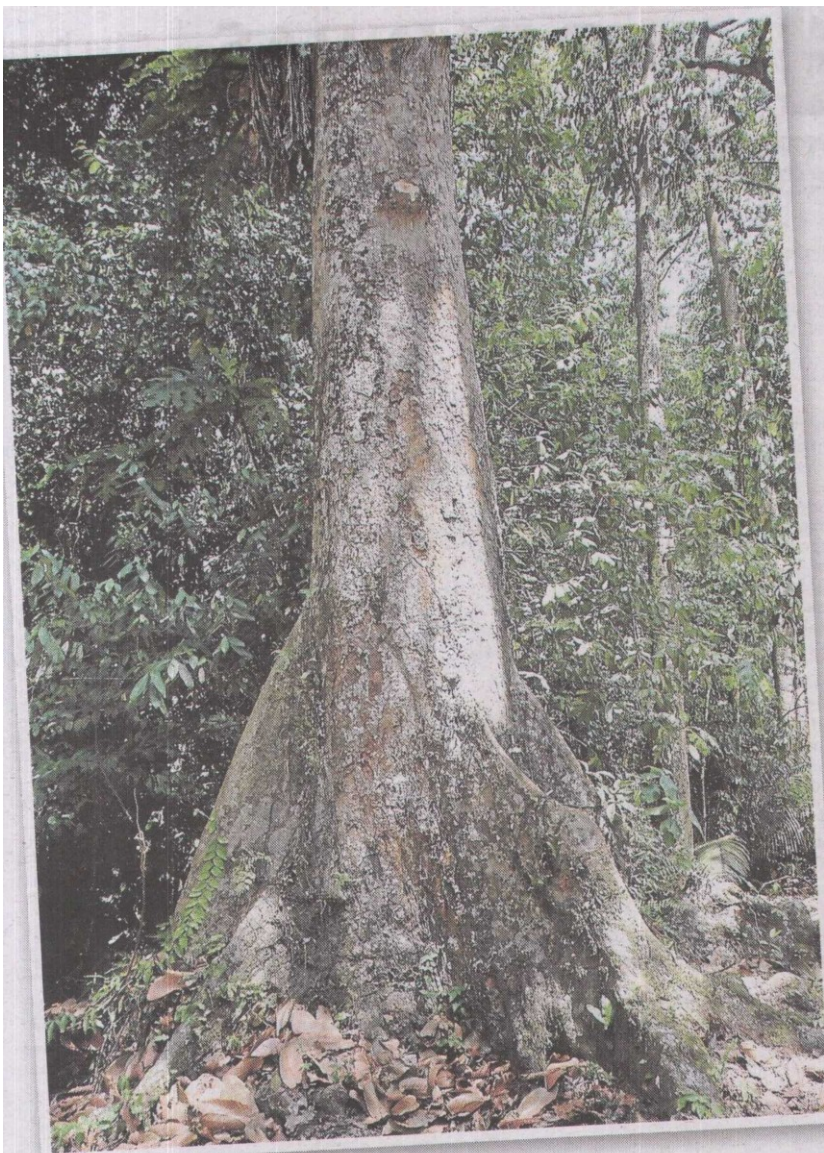
Rare species: Engkabang trees found at FRIM.