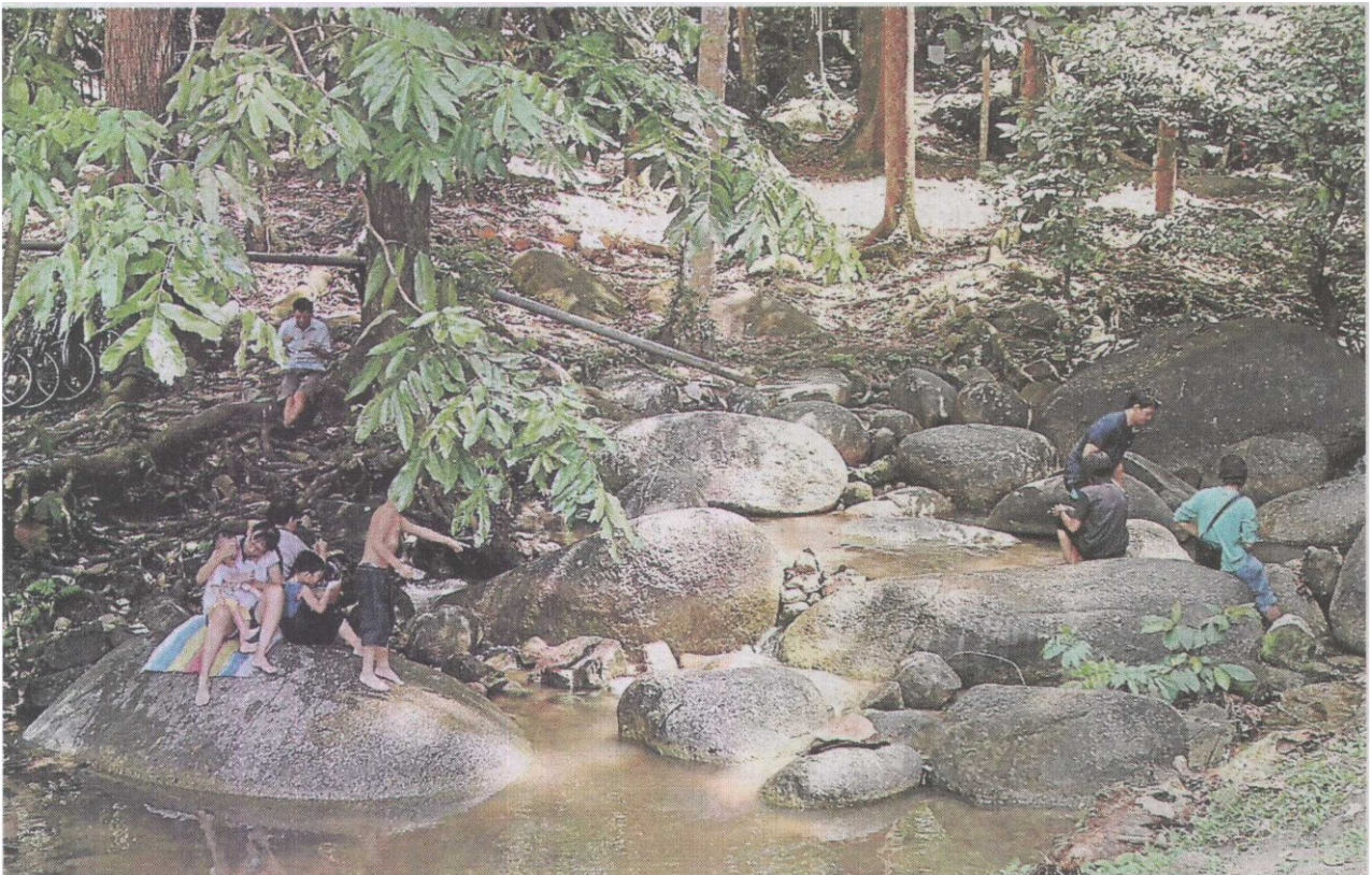
Picnic time: Families enjoying their day at FRIM.