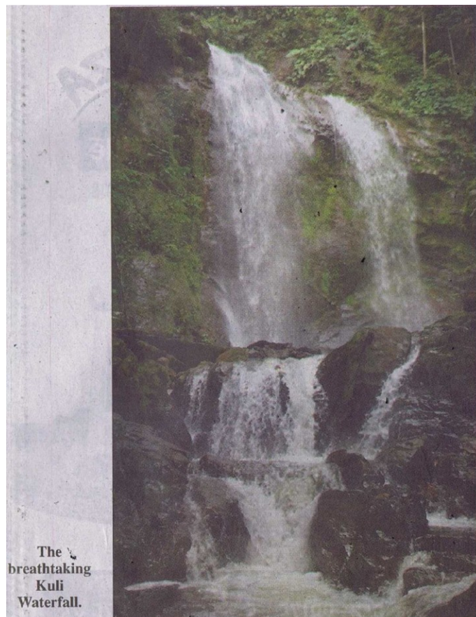
The breathtaking Kuli Waterfall.

Capacity building is one of the core-programmes under Yayasan Sabah-Petronas Collaboration.