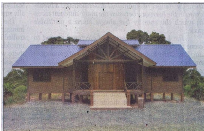
The Ulu Kinabatangan Information Centre.