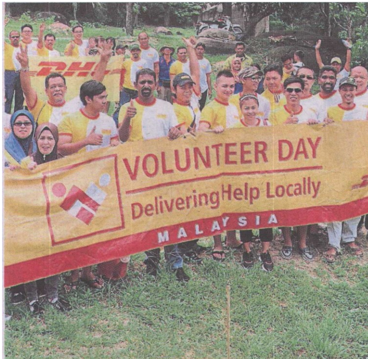
Excellent delivery: DHL employees in Johor got their hands and feet dirty by planting tree seedlings as part of DHL's Global Volunteer Day in collaboration with Johor National Parks Corporation.