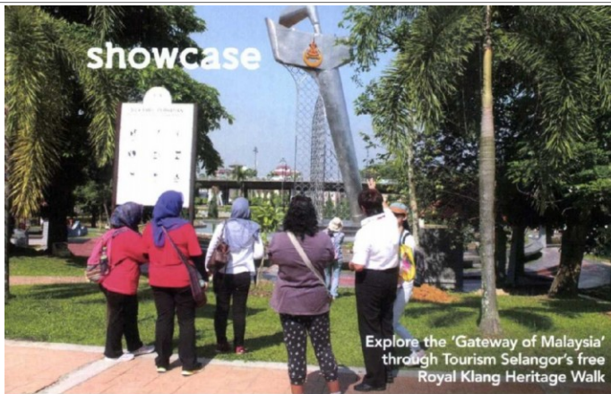
Explore the 'Gateway of Malaysia' through Tourism Selangor's free Royal Klang Heritage Walk