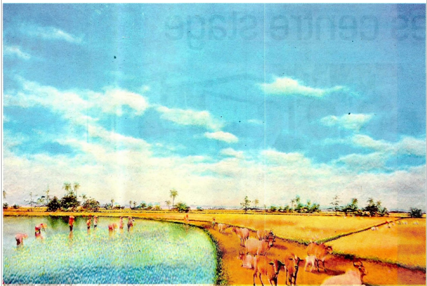
Peaceful: Tranquility, but for how long? – Yeong’s ‘Malaysian Sky Series’.