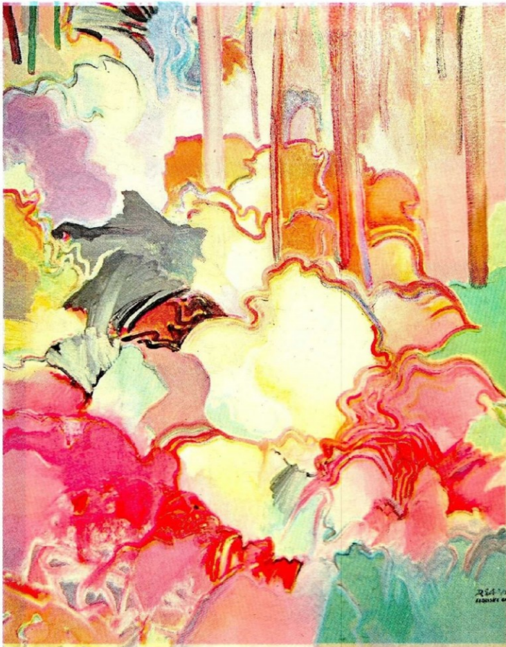
Pretty petals: 'Exquisite Garden' by Ahbeng expresses the artist's quest to not abandon or treat lightly, God's greatest gift – our environment.