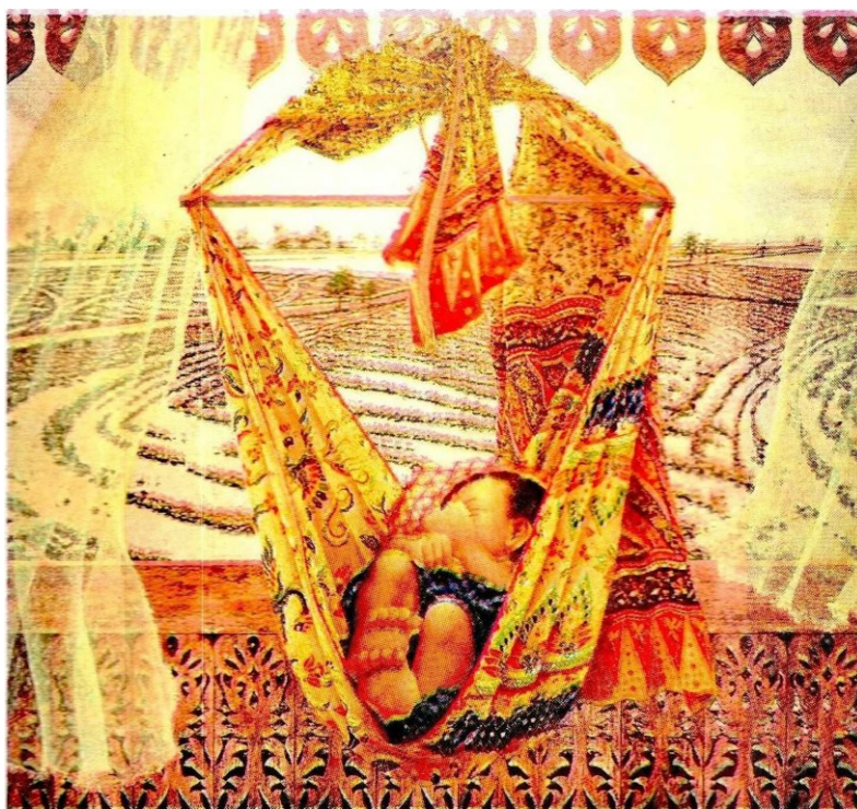
Just like old times: The three important elements in this piece by Yeong are babies, birds and nature, which create harmony.