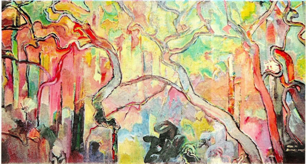
Colours of the trees: Ah Beng's 'Borneo Magic' depicts the beauty of the jungle.