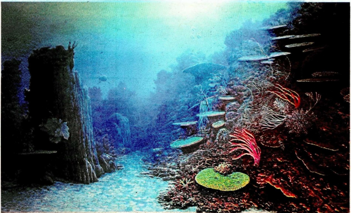
Beauty beneath: 'Ocean Mystery' by Ajis shows the beauty of underwater life.