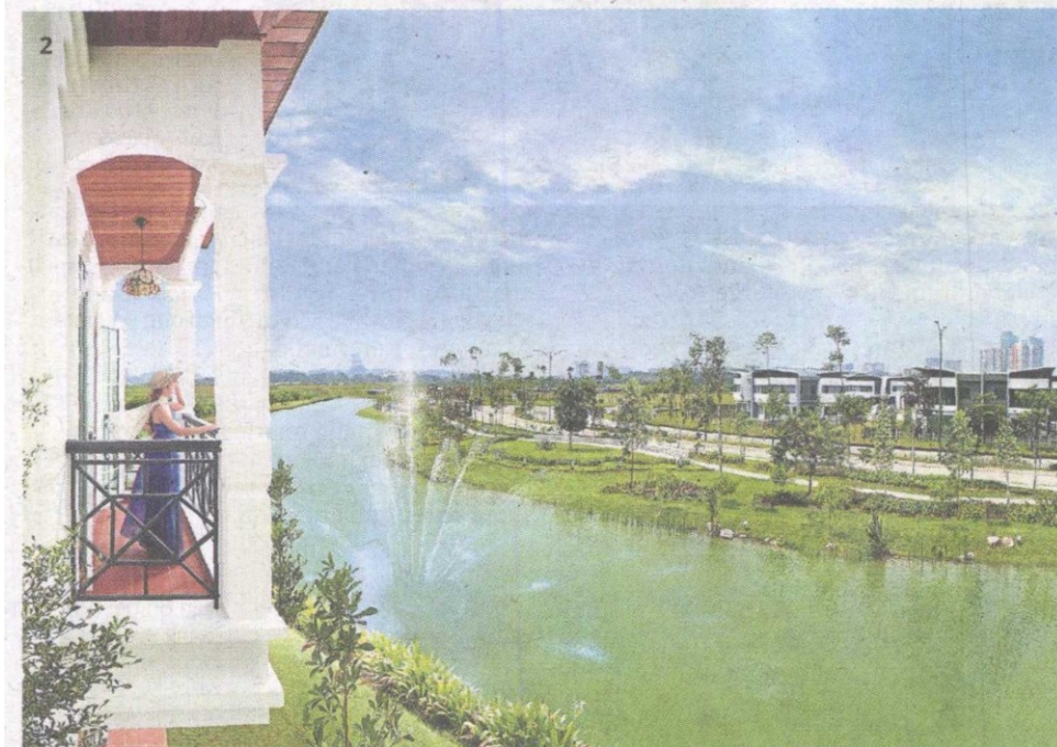
1 The development features large areas of gardens and parks as well as clubhouses to serve the whole community. 2 Setia Eco Glades in Cyberjaya comprises eight different design concepts on eight different islands with eight fountains.