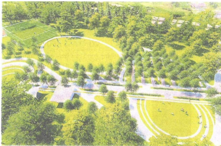
The recreational park at Persiaran Putra Perdana will have a 44m open lawn for public use when completed.

Police officers from Subang Jaya also took time off to join the community event.