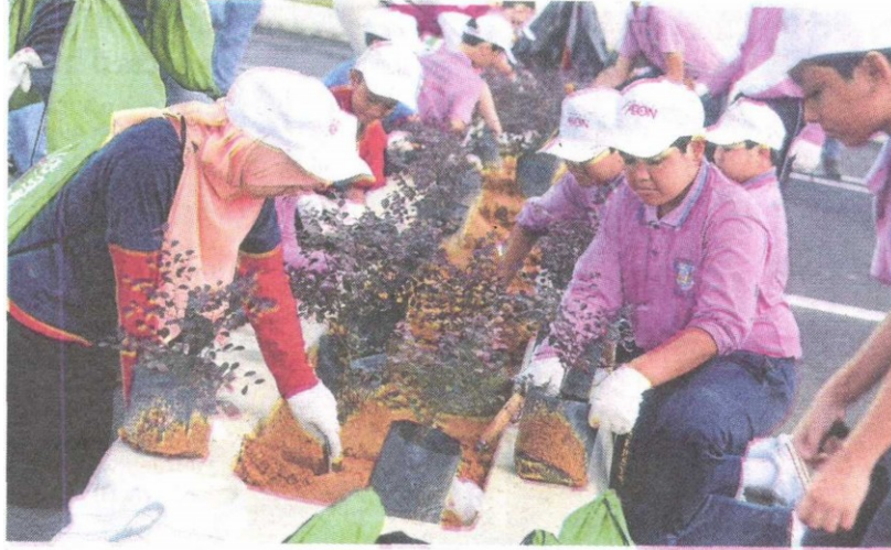
Volunteers planting trees around Aeon Mall in Shah Alam.