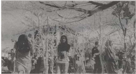
Visitors to the Royal Floria Putrajaya admiring Kuala Lumpur City Hall's feature garden, themed 'Do You Believe in Magic?'.