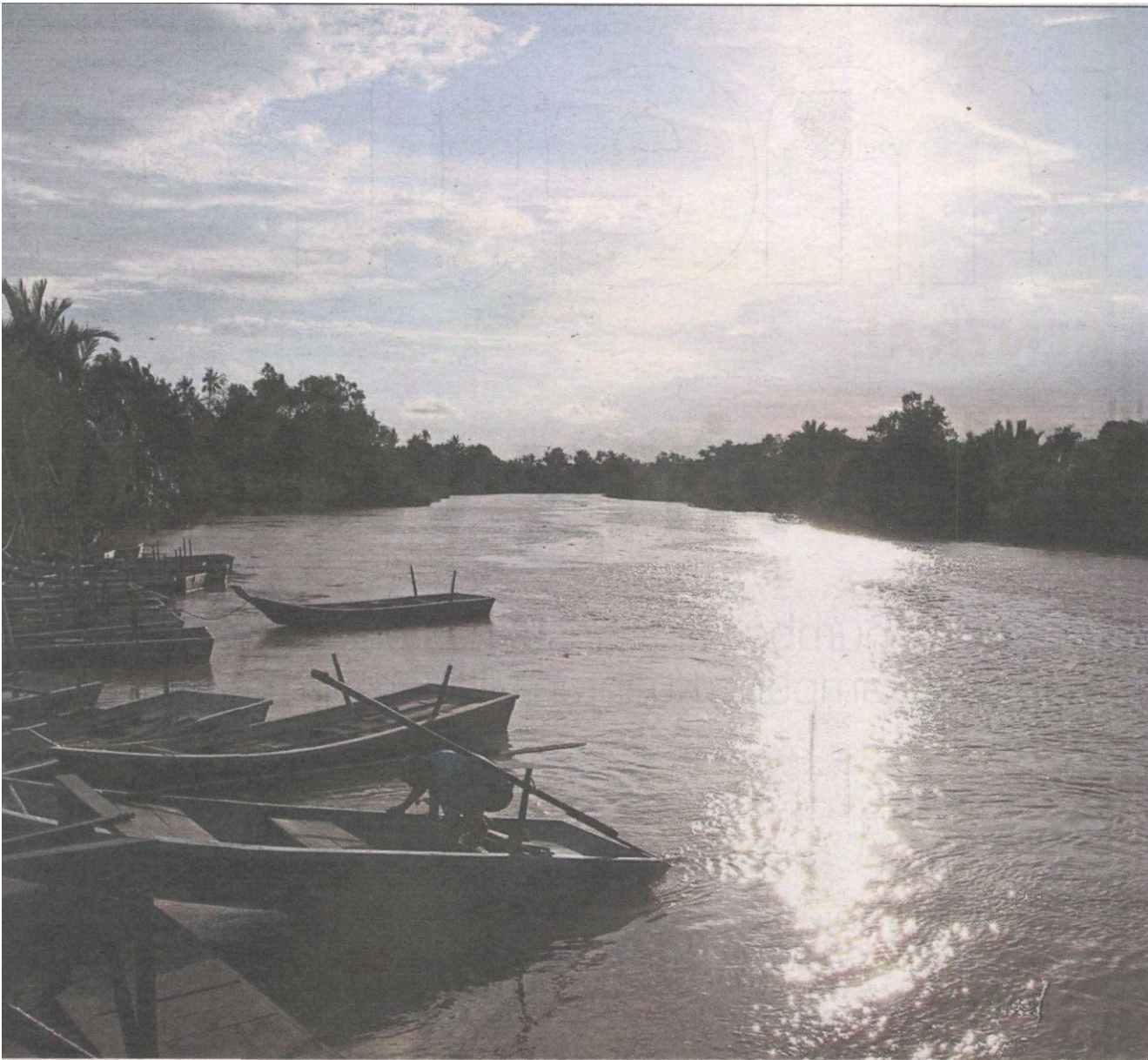
Boats tied up at the Kampung Kuantan jetty on Sungai Selangor at dusk.