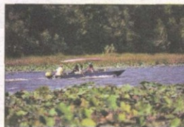
Visitors can enjoy a scenic view and explore the Orang Asli villages by taking a boat ride.