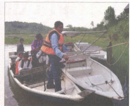
Orang Asli children going to school on boats.