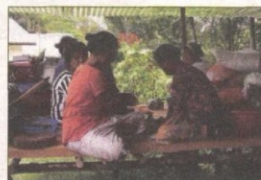
New tourism projects saw participation of Orang Asli villages through homestays and the sale of local handicrafts.