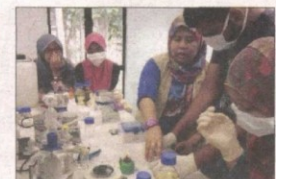
Researchers at PPTC conducting studies to monitor the water quality.

led by the NRE was established to oversee the enforcement, education and implementation of initiatives in Tasik Chini. The Task Force via its four sub-committees, together with the solid support of other stakeholders, will combine efforts to improve the water quality in Tasik Chini to Class I by 2018," said Dato' Sri Dr. Haji Wan Junaidi bin Tuanku Jaafar, the Minister of Natural Resources and Environment.