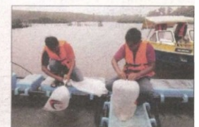
Improving the fish population via aquaculture approach.