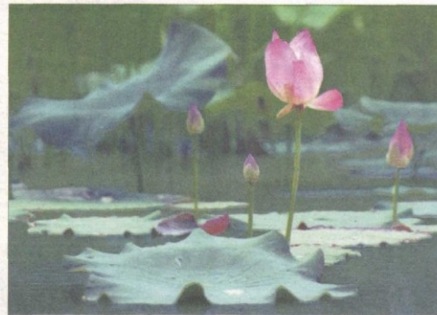
The Iconic Lotus of Tasik Chini.