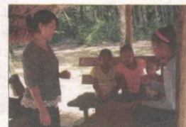
Visitors experiencing Orang Asli culture and heritage.

More is being done to further improve the water quality at Tasik Chini. "A Special Task Force