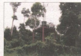
The water quality in Tasik Chini is ensured through seven water monitoring stations.