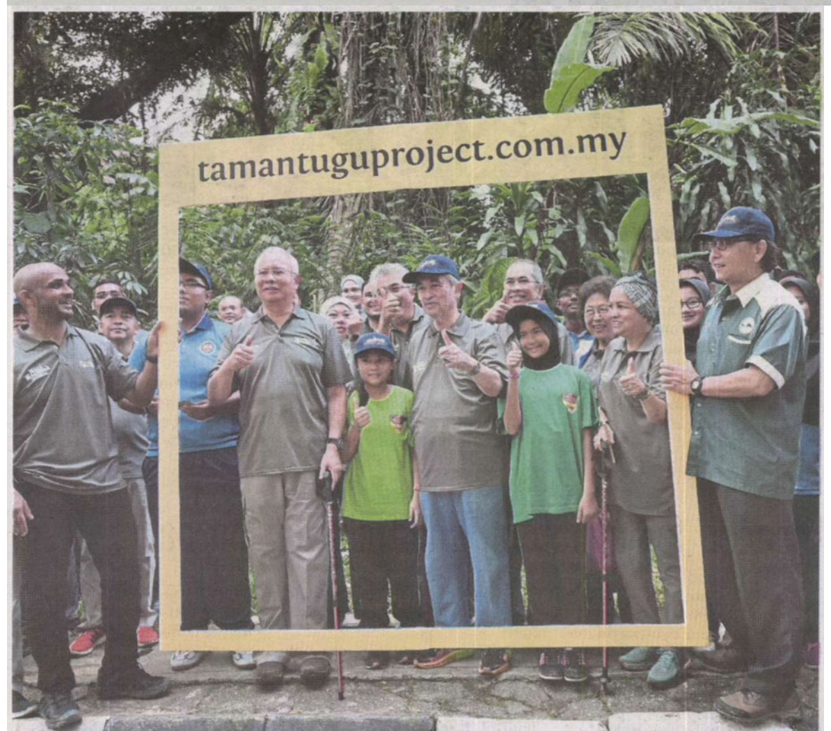
Prime Minister Datuk Seri Najib Razak and former prime minister Tun Abdullah Ahmad Badawi in Taman Tugu yesterday.

The project complements the 11th Malaysia Plan as well as Greater Kuala Lumpur and Klang Valley initiatives to transform Kuala Lumpur into a world-class city by 2020, by, among others, enhancing its pedestrian network.