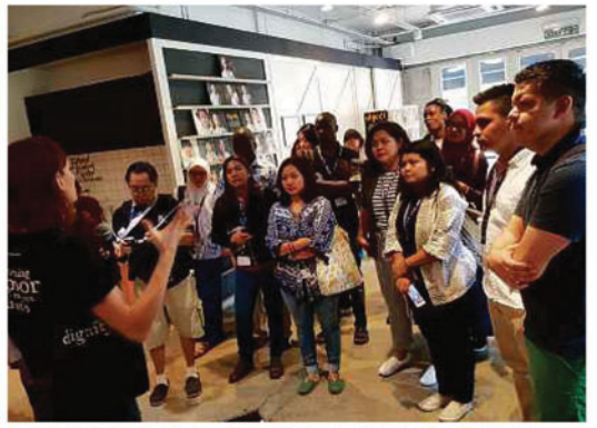
Delegates being briefed on the work done at Dignity Youth Kitchen

Malaysian cities are at the forefront in responding to national challenges as a chance to add holistically to the quality of city life. Malaysia has anticipated urban solutions with innovation that transform the lives of millions of city dwellers by improving transportation, sewage systems, producing resilient power networks, sustainable homes, new workplaces and inspiring cultural facilities. Under this route, the visits were scheduled to Bandar Sun-