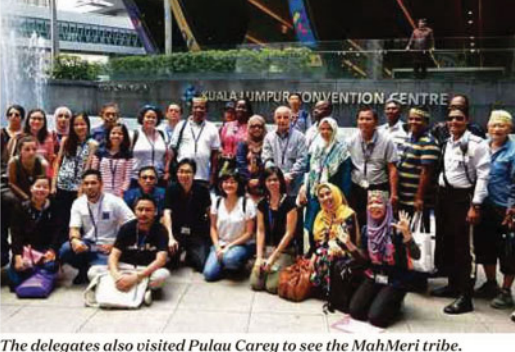
The delegates also visited Pulau Carey to see the MahMeri tribe

Homeless Transit Centre, Residensi Kerinchi and PPR Seri Alam to learn