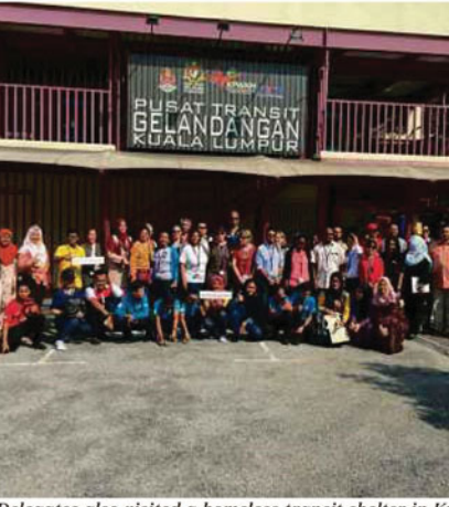
Delegates were shown solutions that have helped transform urban living for

Urbanisation has significant impact on rural areas, and demand for food is perhaps the most important, together for demand for other natural resources. In many regions of the world there is an increase in production, especially of perishable and high-value products such as fruit, vegetables and dairy, responding to urban demand. This is especially the case in rural areas that are well connected to urban markets by transport links, communications and electricity, and by networks of local traders. For this route, a visit was scheduled to Carev Island, where visitors met the Orang Asli of Mah Meri tribe. Delegates were delighted to participate in the eye-opening visits. The visits provided an enriching experience for the delegates so they could brought back the knowledge and experience to their home country.