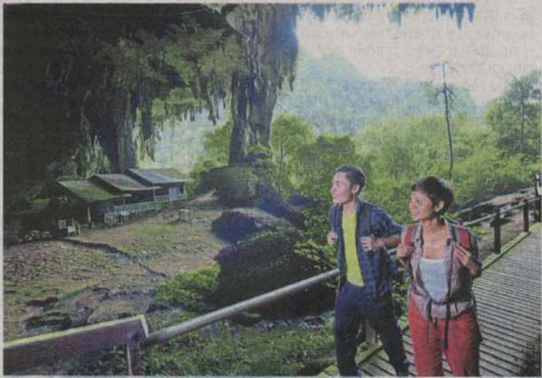
A wedding in a cave is a novel idea.