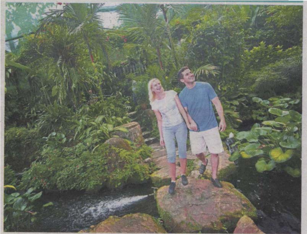
KL Bird Park would make for a gorgeous setting for your wedding pictures.