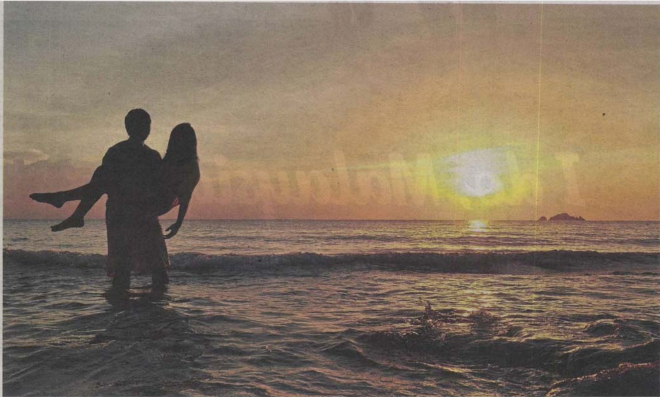
Beach-themed weddings in Malaysia are very popular with local and foreign couples.