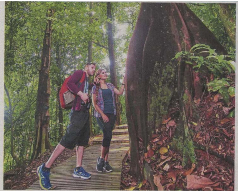
Get married at beautiful forests like the KL Forest Eco Park.