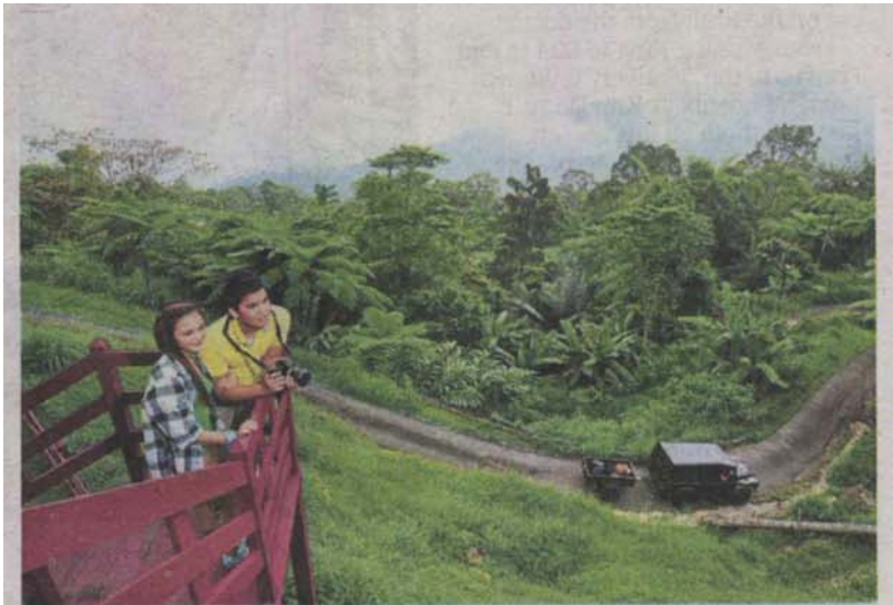
Bukit Larut in Taiping, Perak.