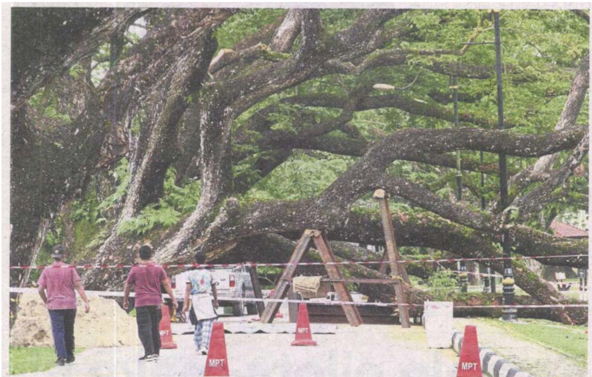
Clearing the road: Workers conducting repair works along the stretch of road where the rain tree fell at the Raintree Walk at Taiping Lake Gardens. — Bernama

Even The Guardian mentioned Taiping Lake Gardens in a write-up last year about towns in South-East Asia, saying that it was a place known for its “sprawling green grounds, lined with ancient rain trees”.