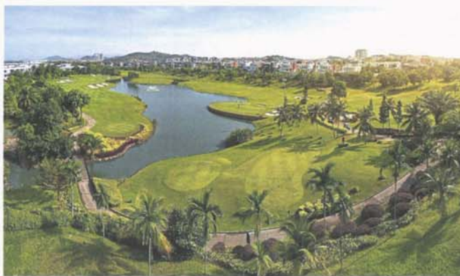
Homes carefully planned to take advantage of the lush green golf course at Horizon Hills.

NOT a stranger to the real estate industry locally or overseas, Gamuda Land has remained committed to its town-making principles since the inception of its first township development - Kota Kemuning in Shah Alam, Selangor - more than two decades ago.