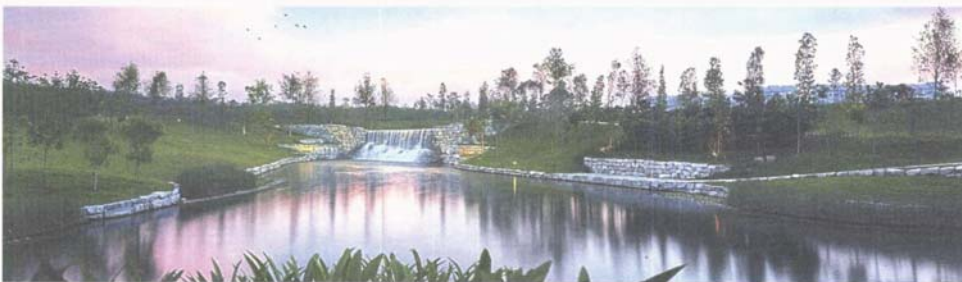
Gamuda Gardens will be a place where the community and nature can co-exist in harmony.