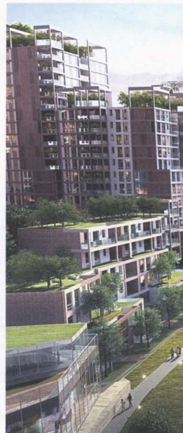
Gamuda Cove is planned as a smart sustainable city.

Stepping up its place-making efforts to devel-