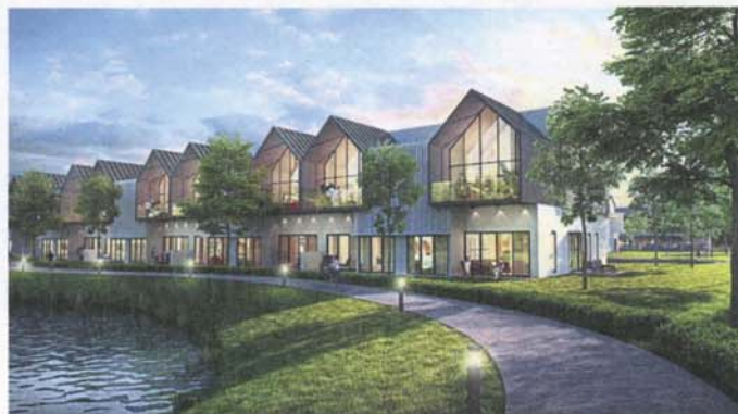
Lakeside Homes at Kundang Estates are designed for multi-generation living.

What gives Gamuda Land the edge is the company's drive to constantly innovate to create value for the community. Its latest innovation of