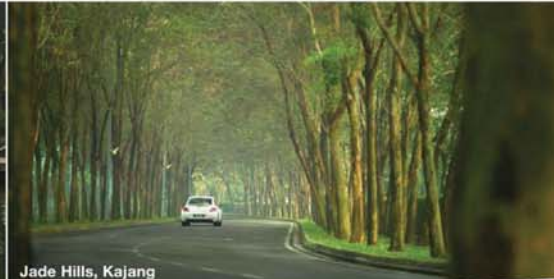
Jade Hills, Kajang Actual Photo