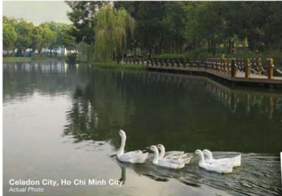
Celadon City, Ho Chi Minh City Actual Photo