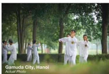
Gamuda City, Hanoi Actual Photo

Find out more about the events at Gamuda Land Facebook page or log on to https://gamudaland.com.my/gamudaparks/