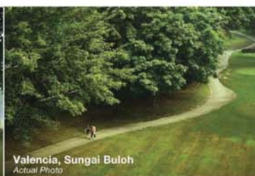
Valencia, Sungai Buloh Actual Photo