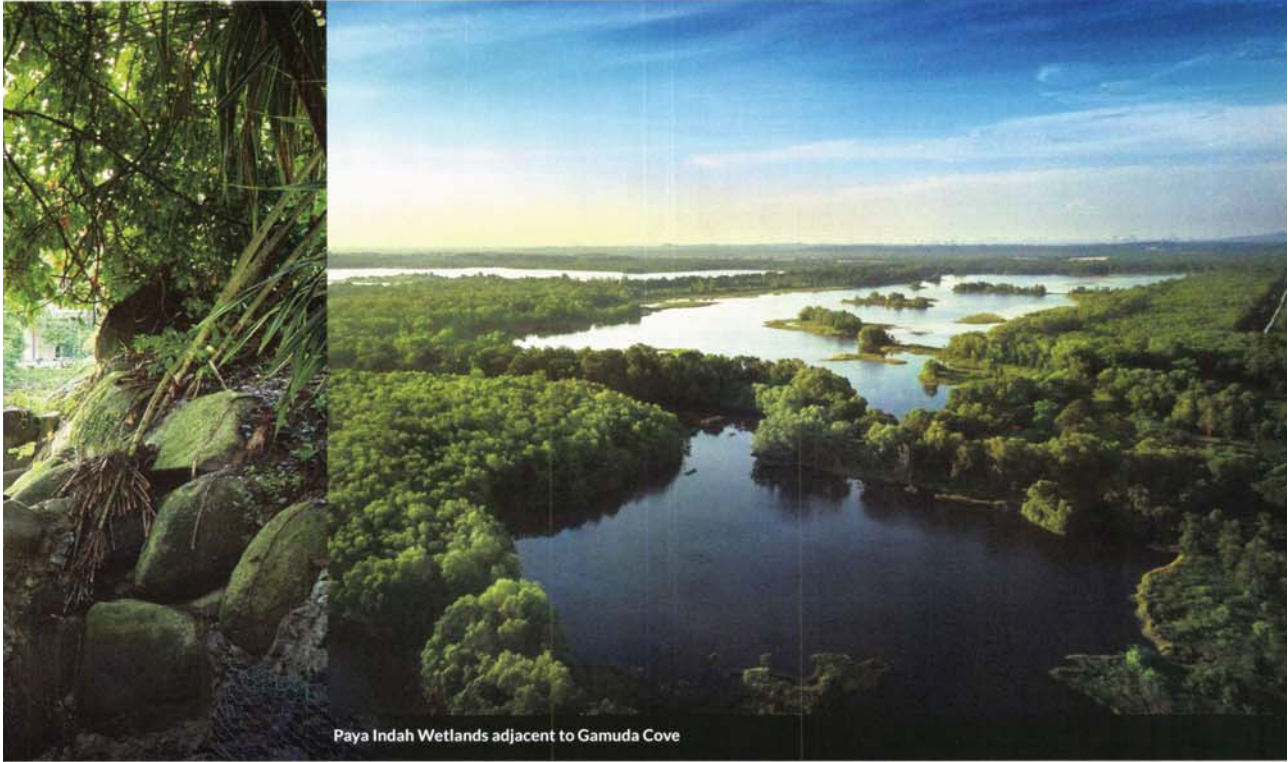
Paya Indah Wetlands adjacent to Gamuda Cove

"The fact that Gamuda Land has committed itself to this initiative shows that it is progressive. Even the conscious decision to identify external experts as a panel of advisers, instead of consultants, speaks to its resolution to ensure that its partners enjoy autonomy in shaping the biodiversity policy."