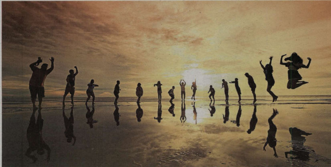
Take 'Instagrammable worthy photos' at Sky Mirror, Kuala Selangor