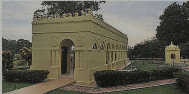
The Makam Sultan Abdul Samad at the Royal Mausoleum in Bukit Jugra was constructed according to Moorish and Islamic architecture

He said one of the most popular sites and "Instagrammable worthy photos" is the recently discovered Sky Mirror, Kuala Selangor, named after its mirror-like reflection of the sky. Sky Mirror is also dubbed as Malaysia's own Bolivian "Salar de Uyuni".