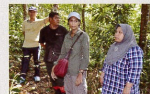
Arboretum and nature trail