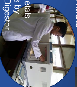
Heavy metals analysis by Microwave Digester